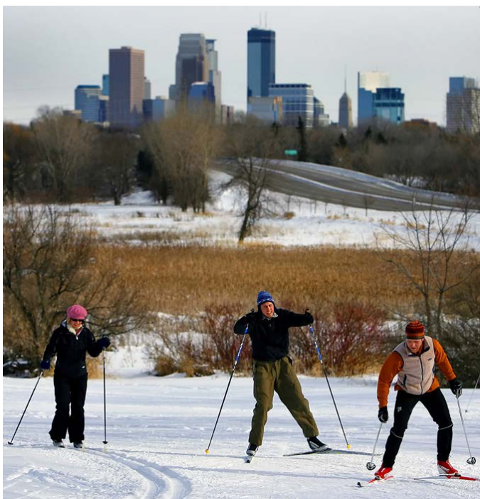
Skiers venture out on the Skyline Trail at Theodore Wirth Park.