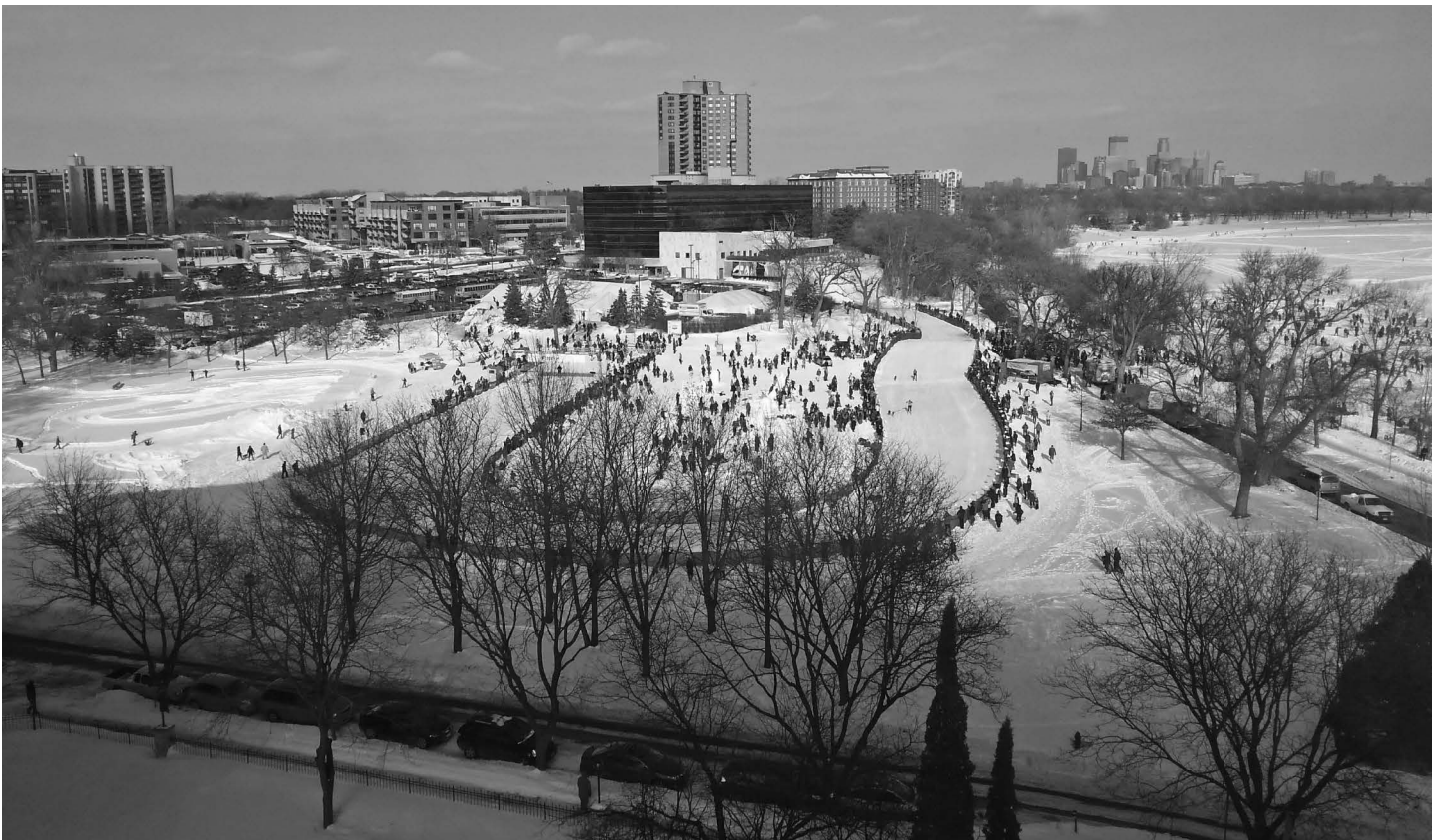
View of Loppet Village as skijorers finished up one of their many events.