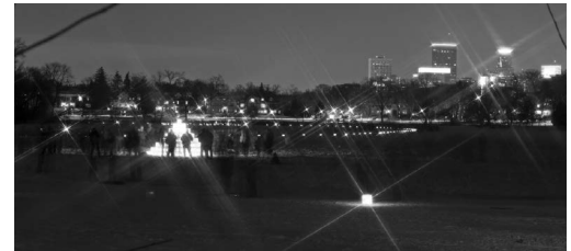
(Left) New Subaru Dogsled Loppet takes off. (Top Right) New Snowshoe Loppet kicks into gear. (Bottom Right) Comcast Luminary Loppet shines its brightest yet!